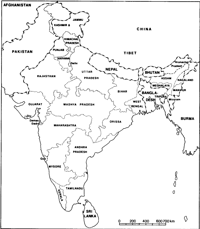
MAP 1-1. India.