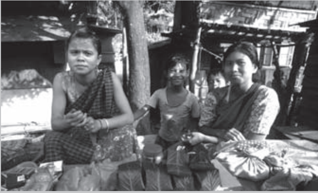
Khasi women selling betel nut and tobacco, Ri Bhoi District, Meghalaya.