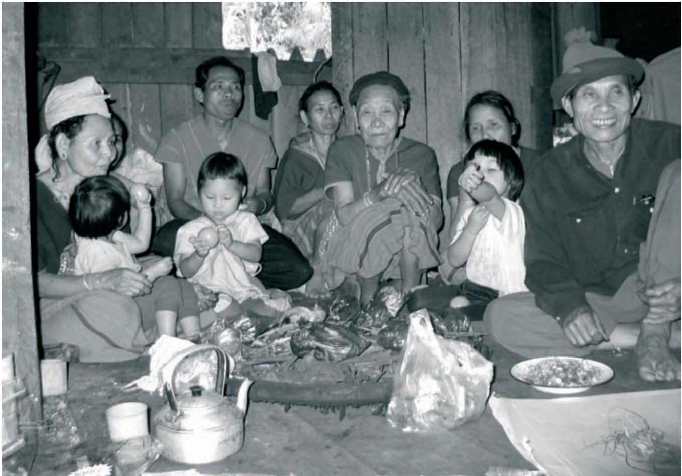
In the kitchen: three generations get together, singing songs for the cucumber, the eggplant, sesame...