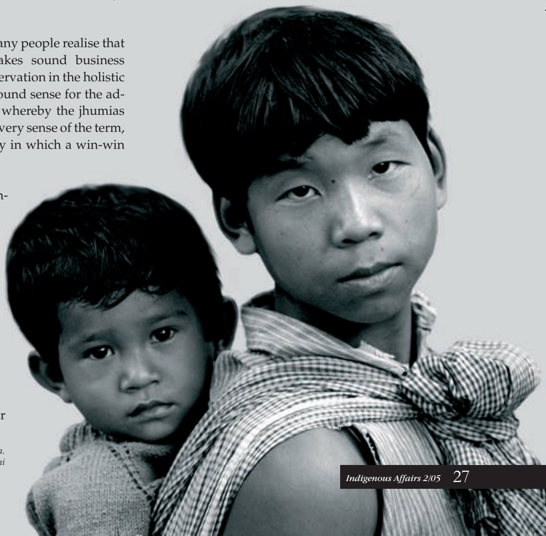
Garó boys, West Garó Hills, Meghalaya.

(Dhrupad Choudhury): True, shifting cultivation causes changes in forest cover, but it does not cause defor-