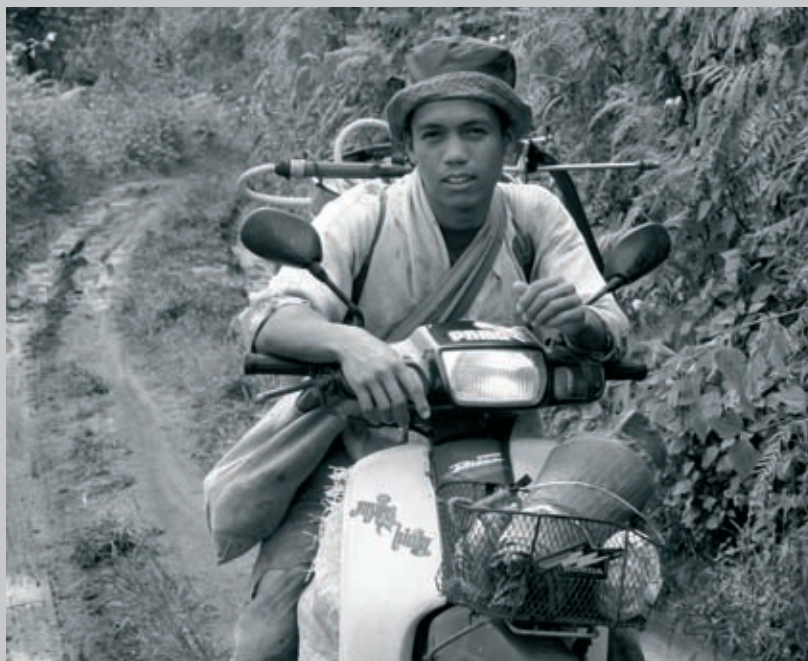
Vegetable cash crops need heavy inputs of agrochemicals: young Lua farmer returning from spraying his field.

Over the past few decades, state enclosure in these three groups of swidden communities has resulted in changes in the features, stages and lengths of cycles of swidden agriculture. The severest impact has been the