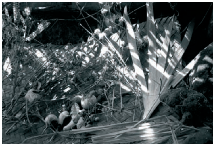
Many kinds of vegetables, spices, herbs, tubers and flowers are gathered from the swidden field even long after the main harvest.