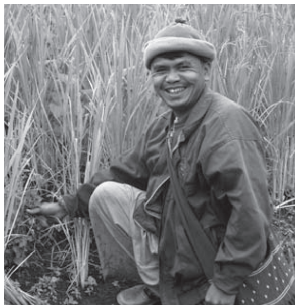
Proud owner of a rice swidden: Lua swidden farmer from Mae Hong Son province.

Swidden agriculture is commonly held to be the primary cause of forest destruction in Asia. In Indonesia, swidden agriculture was seen by the Dutch colonizers as “the robber economy” since it competed with the colonial state for the use of forest resources. 1 In India, the traditional practice of swidden farming was perceived as the most “destructive” form of agriculture by the British foresters, particularly during the period of British expansion of forest exploitation into mountainous areas. 2 In Thailand, the term “ rai luan loy ”, literally “drifting field”, is used in official discourse to refer to what they see as a “slash-and-burn” farming method practiced by the hill tribe people 3 in mountainous areas. Such a term carries the ethnocentric pejorative connotation of swidden agriculture as being “nomadic” and “temporary” 4 as opposed to the assumed “permanent” agriculture of the lowland communities. As a result, since 1985, Thailand’s national forestry laws and policies have been hostile to swidden agriculture. With little understanding of their traditional land use systems, many government programs have combined the resettlement of hill tribe villages with forced conversion of swidden cultivation into permanent agriculture. The implementation of these programs reflects the state’s pejorative view of tribal people by associating local practices of mobility and swidden agriculture with a presumed “threat” to national security and “deforestation”.