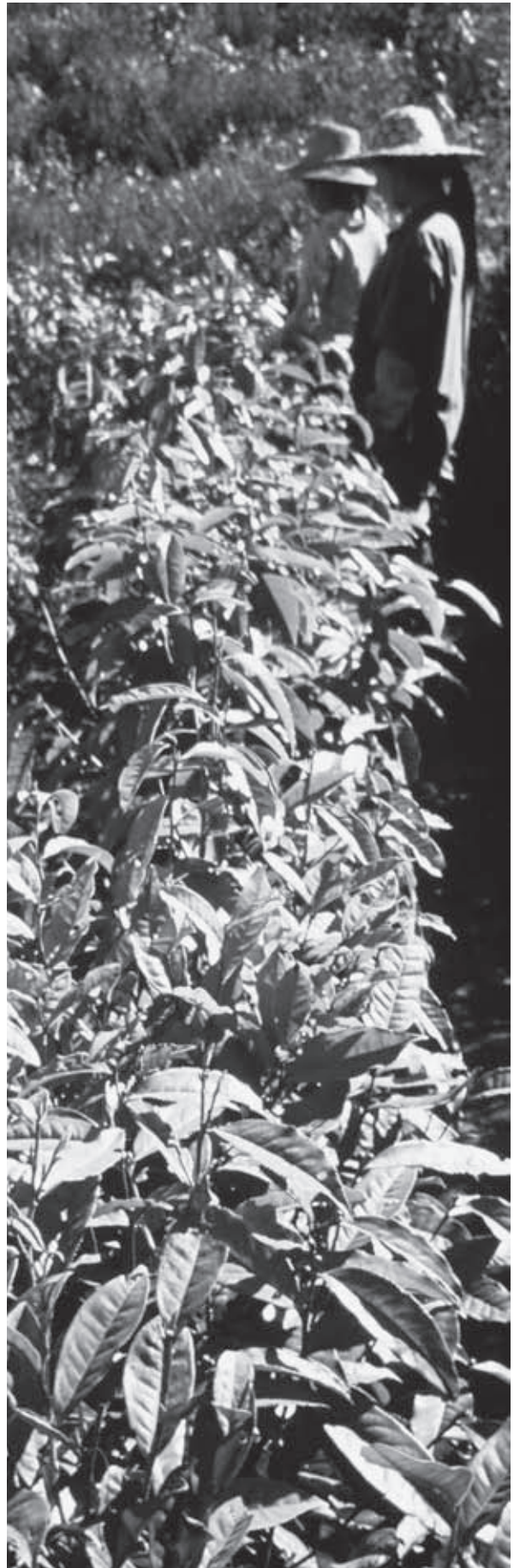
New tea garden in Mengsong

In sum, the overall outcome of the timber ban, the Grain for Green program and the poverty alleviation program has been a simplification of the cropping system by replacing biodiverse shifting cultivation lands and pastures with monoculture tea. How this came about involves a murky story of township administrators convincing farmers to give up their land to regenerate into forest, even though the Grain for Green program had not yet started in their township. Township administrators also claimed any fallowed swidden lands with ma-