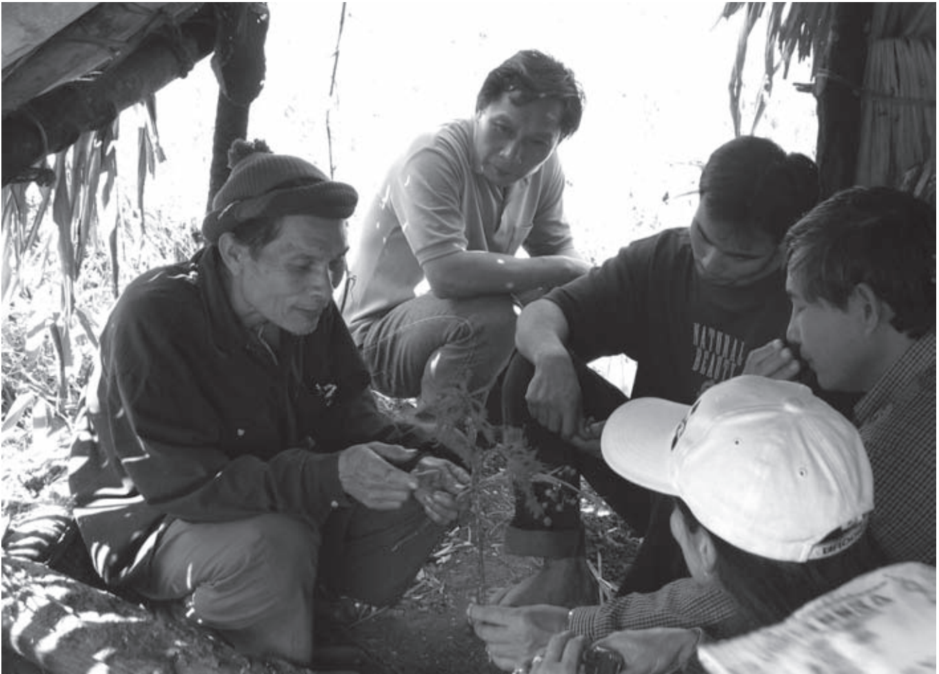
Sharing the elders' knowledge.

over by black pine. We walked to the south-west of the village, an area reserved for rotational farming. A group of three generations of farmers guided us to their swidden fields. During the walk, they showed and explained to us the diverse uses and meaning of trees, plants, animals, insects, streams and farming areas.