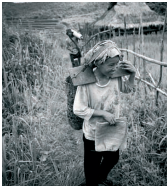
Akha couple returning from the field.

cipality ruled by Tai people who are socio-culturally closely related to other Tai groups in neighboring countries of mainland Southeast Asia. 3 An array of other ethnic groups inhabit the uplands, such as Akha, 4 Lahu, Yao, Jinuo 5 and Bulang. All of these peoples were considered “barbarians” on the frontiers of the Chinese empire. Most of them originated in what is now China and later spread into contiguous hilly parts of Burma, Laos, Thailand and Vietnam. For centuries, upland farmers in Sipsongpanna practised shifting cultivation. Even many of the lowland Tai planted both wet rice fields and shifting cultivation lands until the 1980s. Before 1950, primary tropical and subtropical forests carpeted both the valley and surrounding mountains in Sipsongpanna.