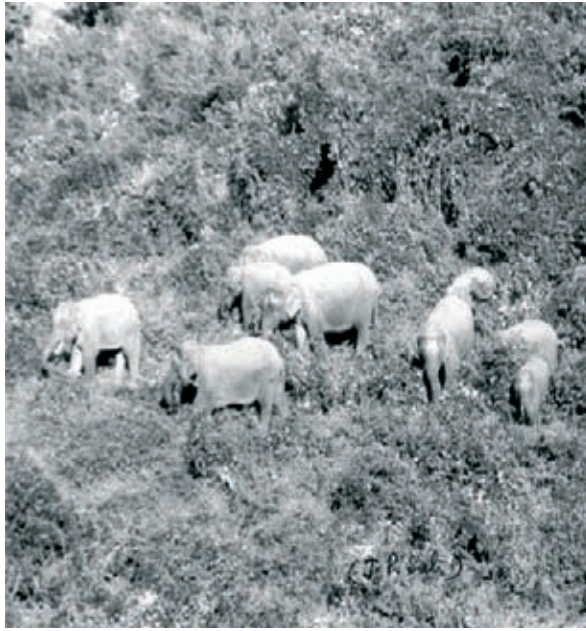
Elephants feeding in a fallowed swidden field. West Garo Hills, Meghalaya