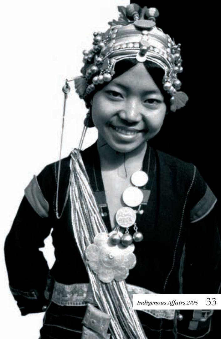
Akha girl. Luang Nam Tha province, Laos.

Village consolidation means that two or more villages are resettled to one location. Remote and small mountain villages are usually resettled to the lowlands, close to a road or a market. "Village consolidation is officially phrased as a necessary means of reducing the adverse environmental impacts of shifting cultivation in remote areas" 13 and is considered to be a cost-effective way of making development services available to scattered