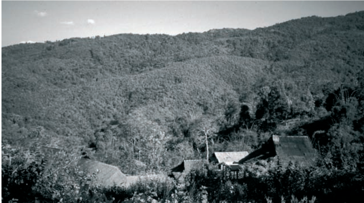
Akha village in the mountains of Luang Nam Tha province, Laos.

and remote communities that would otherwise not be reached with the limited resources available.