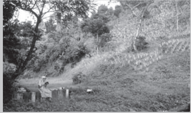
A cash-crop field with pineapples in Ri Bhoi District, Meghalaya.

The Land Reforms Commission Report of the Government of Meghalaya described the rights to land as follows: "If a person vacates or does not make use of the land under his/her actual occupation for three consecutive years, the land reverts to the community --- village, Raid or Elaka (administrative unit) as the case may be. There is no proprietary, heritable or transferable right on the Ri Raid land". 2 It further states that the right to use the Bri Raid is based on that person's membership. A person belonging to Khasi society does not enjoy the right to use the above said land if that person is not a member of the village, Raid or Elaka . Non-Khasi are not allowed to use the Ri Raid . The village headman or the head of the Raid does not have the authority to grant such permission.