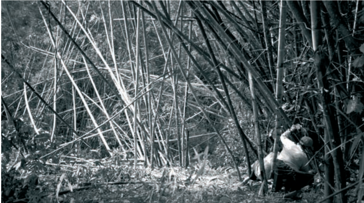
Akha man cutting bamboo to prepare a new field.

livelihood, resettled shifting cultivators try to find government-compliant livelihoods. Villagers having the means either buy paddy land in the plains or join relatives in other villages (if they are accepted by the village council). In one village, the poorer part of the village was left behind. Some looked desperately for another place to go, others did not want to leave but, with the exodus, the minimum number of people fell below 150, making the village a future target for relocation. And many of those with enough money had to realize that there was not enough paddy land available.