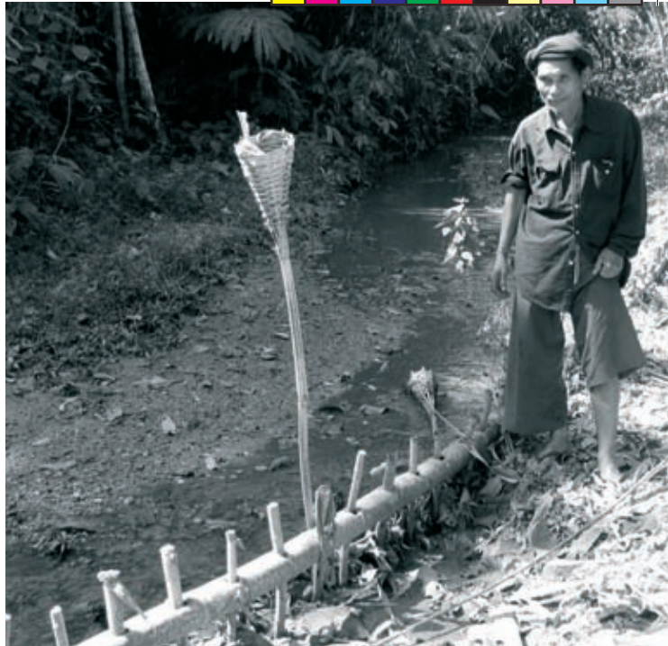
Each place has an economic and symbolic meaning: Ritual site at the junction of two streams.