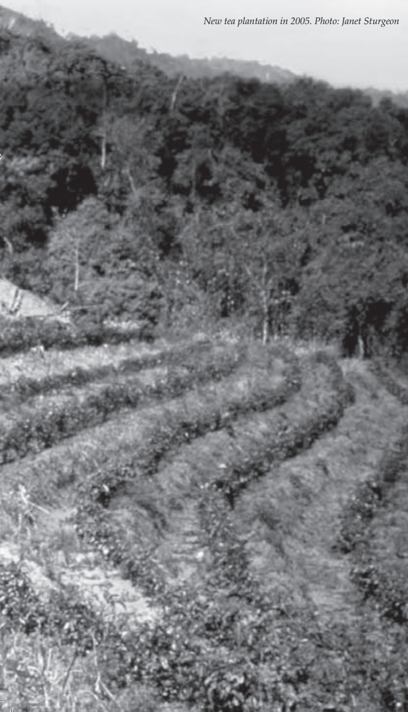
New tea plantation in 2005.