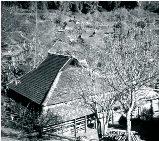
The Akha village Mengsong in Yunnan.