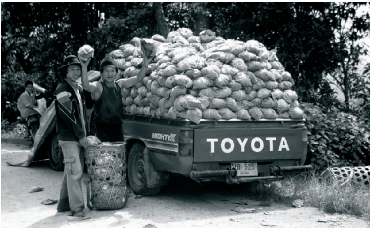
Cabbage harvest to be sold on the lowland market.