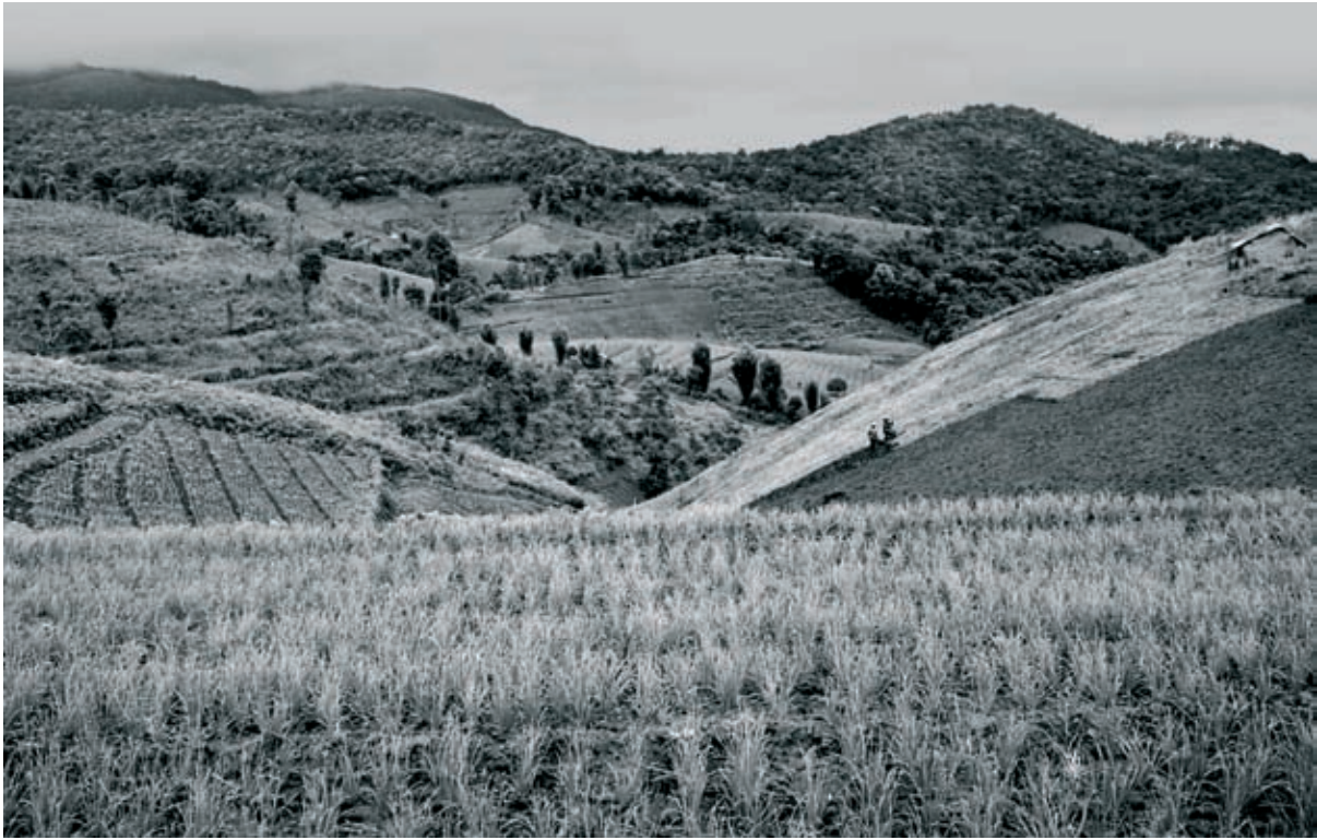
Intensive upland cash-crop farming has been introduced to replace shifting cultivation.