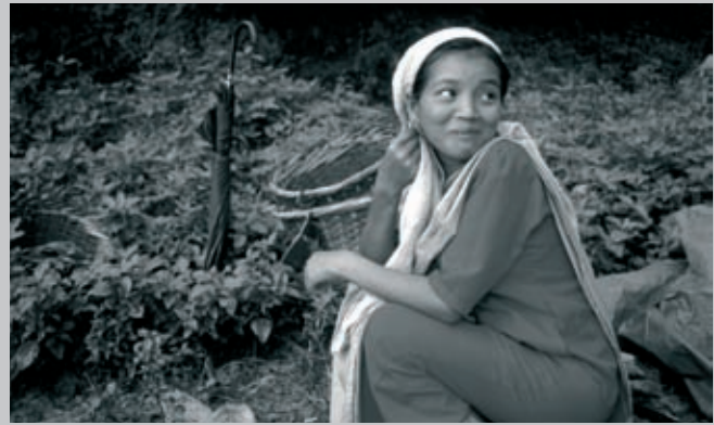
Young Khasi woman.

Ri Bhoi is one of the state's seven districts. It is located in the north of East Khasi Hills District, on the slope leading down towards the plains of Assam. Ri Bhoi is inhabited mostly by Khasi. But there are also other indigenous groups such as the Garos, Karbis, Marngars, Mikirs, Bodos and Lalungs. According to local sources, the non-Khasi indigenous communities were later settlers in different parts of Ri Bhoi.