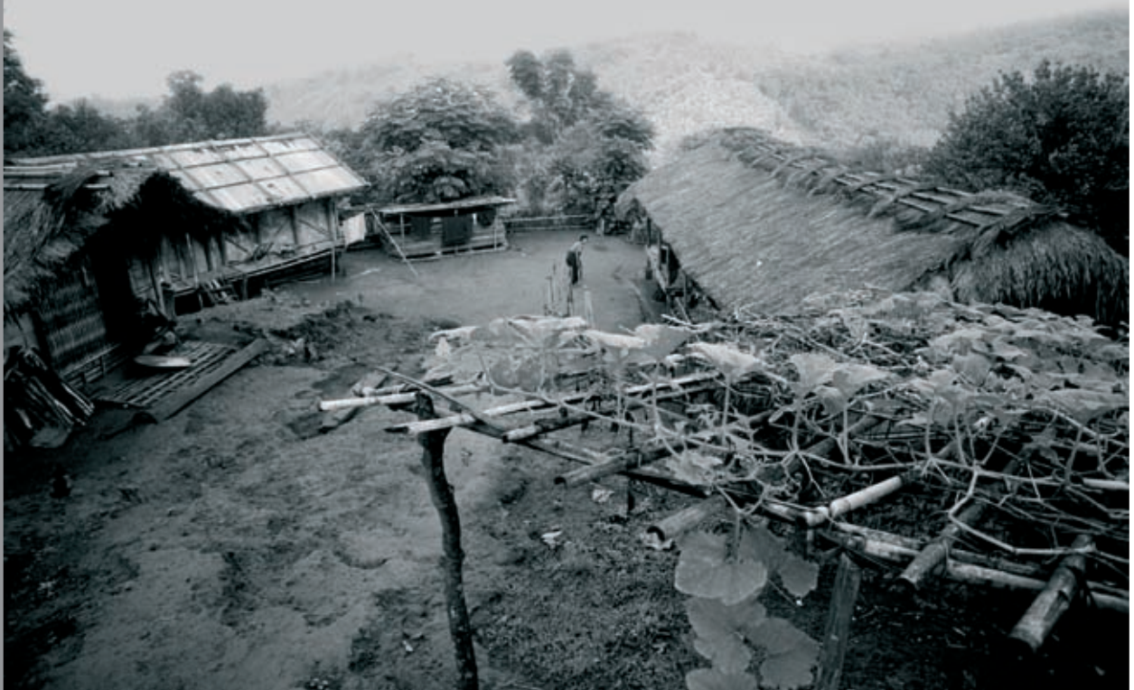
Khasi homestead in Ri Bhoi District.