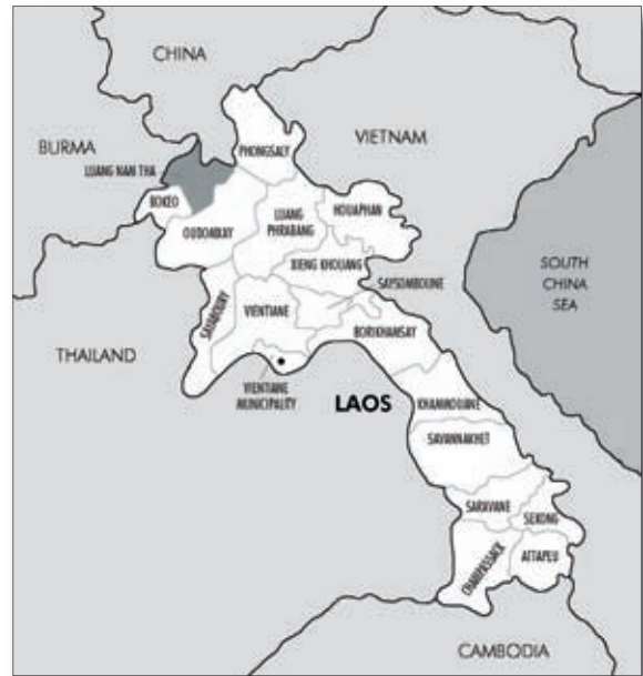
Resettled Akha village. Luang Nam Tha province, Laos.