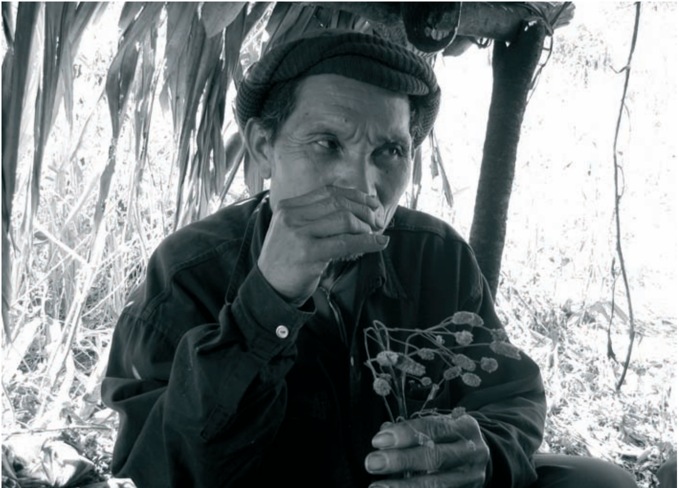
Recalling and using all senses is part of biodiversity conservation.