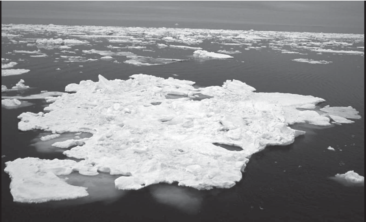
Melting sea ice in the Arctic - Photo: YopFoto/ImageWorks

The crisis consists precisely in the fact that the old is dying and the new cannot be born.