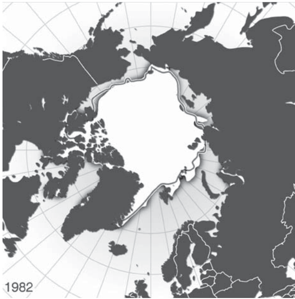
Minimum Arctic sea-ice extent in 1982 and 2007