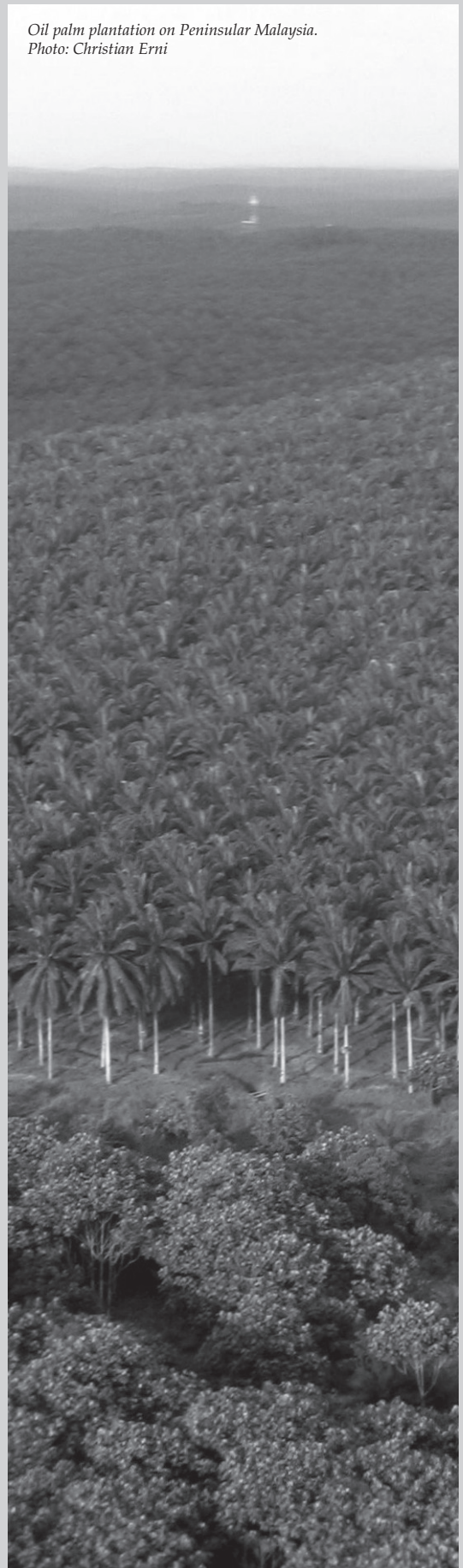
Oil palm plantation on Peninsular Malaysia.