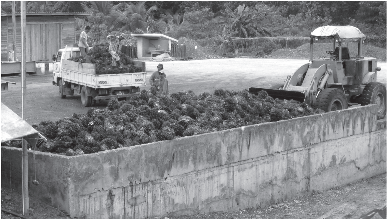
Fruits of the oil palm being loaded at a collection center for transport to the processing plant. Tongod district, Sabah, Malaysia

forest degradation accounts for 20-25% of global greenhouse gas emissions, it does make sense to reduce the unbridled exploitation of forests by corporate interests. However, there are several problems with the proposed set-up.