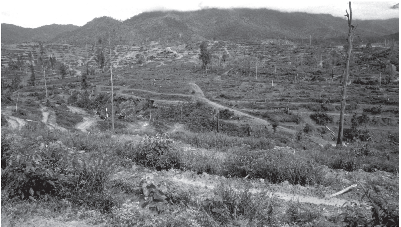
Swidden land and forest of the Dusun indigenous people cleared for oil palm plantation in Tongod district, Sabah, Malaysia

stroyed vast tracts of forest are now being rewarded to protect them.