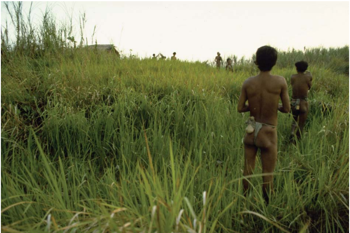
Strategy of withdrawal and avoidance in the 21 st century: The Taobuid of Mindoro island in the Philippines. Among the lowland peasants they are known as the ‘mailap’, the wild, shy, elusive ones.

Parallels with Western colonialism exist not only with respect to the attitude and rationalization (the natives having been considered “primitive”, “barbarian” etc. and thus providing moral legitimacy for subjugating and enslaving them) or their methods (enslavement, forced displacement, raiding, massacring those who resisted) but also with respect to the responses by the native peoples to the expansion of the colonial state: a combination of resistance and withdrawal to remote, hilly, swampy or densely forested areas, like the Amazon basin, a process which in a few places is still ongoing. In the border areas of Brazil and Peru and a few other areas of the upper Amazon basin small groups of indigenous peoples have taken their strategy of withdrawal to the extent of almost