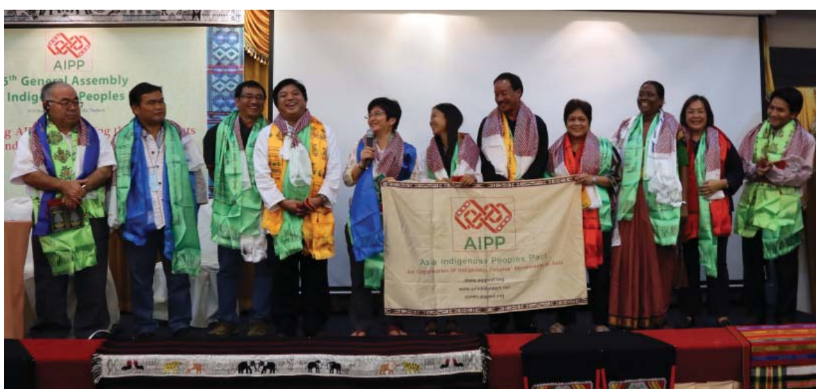
Secretary General and the 10 newly elected Executive Council members of the regional Asia Indigenous Peoples Pact (AIPP), 2012. They represent 47 member organisations from 14 countries in Asia.

The enthusiastic response of marginalized tribal peoples to the concept of indigeneity and the claim to rights it implies has not been well received by governments. It represents a challenge to the state’s monopoly to power