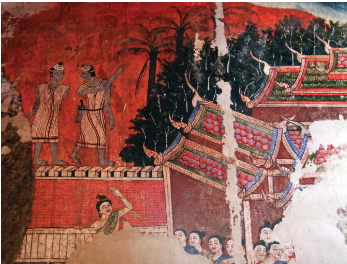
19 th century murals in Wat Phumin, Nan, capital of present-day nan Province in Northern Thailand depicting the people of the muang (princely state/city state) and, outside the city wall, the people of the forest. See also murals reproduced on the front and back cover.

Individual agency and choice also stand at the core of Scott’s lucid analysis (2009) of the socio-cultural dichotomy between hill and valley societies found throughout Southeast Asia. He argues that the presence of two fundamentally different forms of societies in Southeast Asia – states in the valleys and along the coasts, non-state people (identified, as mentioned, in colonial “taxonomies” as “tribals”) in the hills, forests, swamps and archipelagic labyrinths – have evolved not simply as a result of the geographical isolation of the latter – “civilization didn’t reach them” – but as a result of choice: “At a time when the state seems pervasive and inescapable, it is easy to forget that for much of history, living within or outside the state – or in an intermediate zone – was a choice, one that might be revised as the circumstances warranted” (ibid: 7).