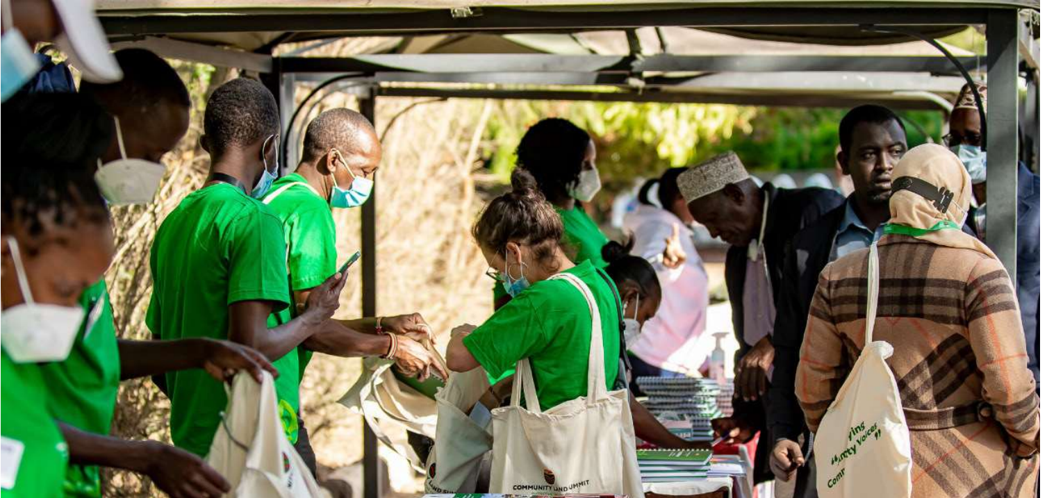
Delegates from 19 counties in Kenya, registering at the first Community Land Summit held at Sportsman Arms Hotel in Nanyuki.

The Summit concluded with observations from participants who: