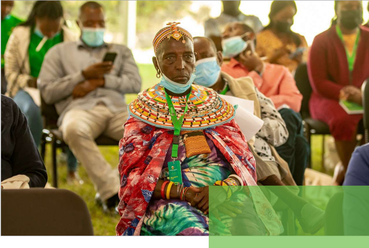
Participants at the Community Land Summit 2021, keenly following the deliberations at the Sportsman Arms Hotel in Nanyuki.