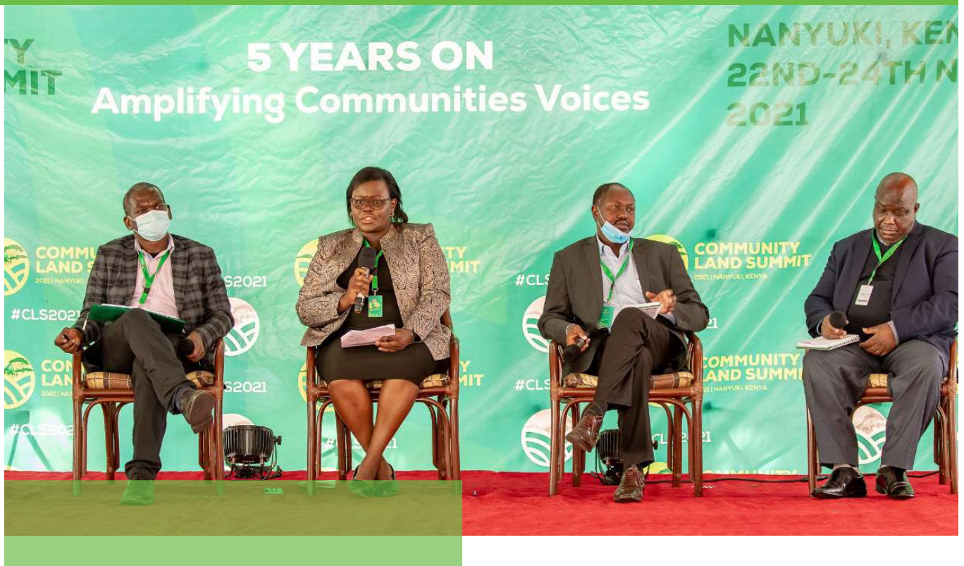
Multi-sectoral panel of experts giving their submissions on the progress of the implementation of the Community Land Act 2016.