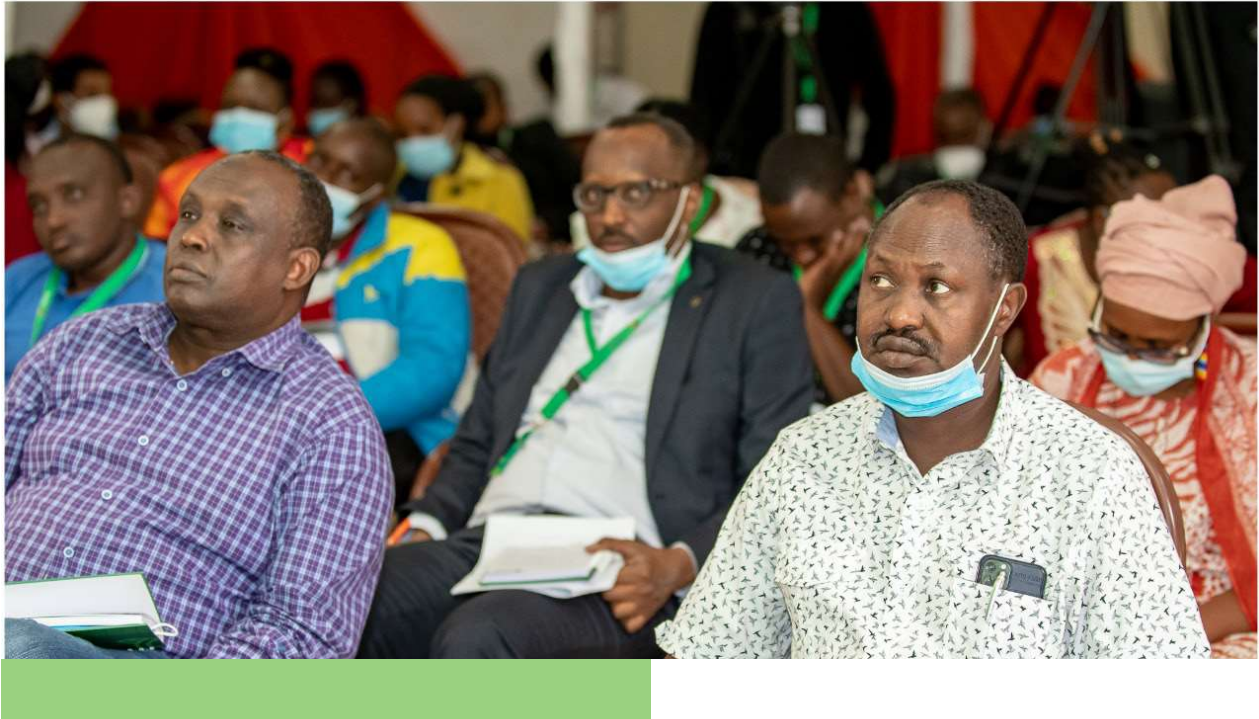
Delegates at the Community Land Summit, 2021 following proceedings, as communities congregated to reflect on the status of the implementation of the Community Land Aact 2016, five years on.

election and activities of Community Land Management Committees and preparation of bi-laws.